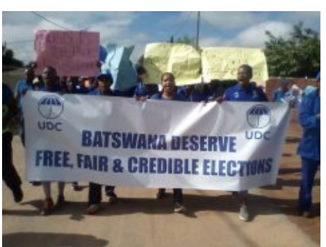
UDC MESSAGE AT TODAY 'S DEMONSTRATION